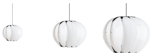
Arkiturbine 30 P1